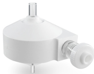
Quartz Twister Spray Chamber with Helix CT P/N 21-809-3192