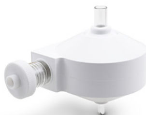
Glass Twister Spray Chamber with Helix CT P/N 21-809-3186

The IsoMist XS incorporates Glass Expansion's proven Glass Twister cyclonic spray chamber design. A Quartz Twister and HF resistant, high-purity PFA Tracey design is also available upon request.. All of which are easily interchangeable, allowing for application flexibility should sample matrices change. All of Glass Expansion's cyclonic spray chambers, including the IsoMist XS feature the Helix CT interface. The Helix CT fitting is completely inert and carefully designed to fix the depth of penetration and torque of the nebulizer seal so that the aerosol produced is optimal. The Helix interface is also the only true zero-dead volume nebulizer/spray chamber interface providing unmatched washout efficiencies. These design innovations have provided Glass Expansion spray chamber sensitivity gains, reduced washout times and reduced matrix effects not possible with other spray chambers.