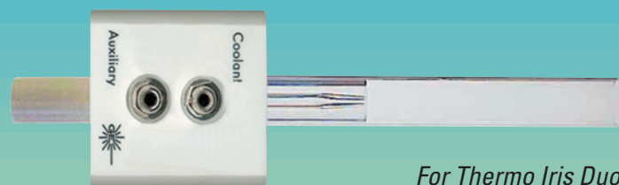
For Thermo Iris Duo