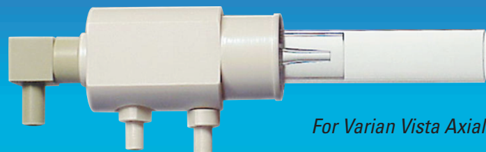
For Varian Vista Axial

Our unique design of rugged o-ring free ground glass joints guarantees that the FDT can be quickly and easily assembled and disassembled. Components are manufactured to micron-level tolerances to ensure exact alignment every time.